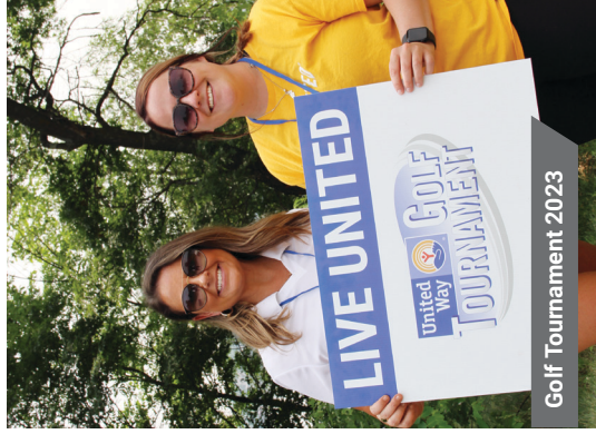
Golf Tournament 2023