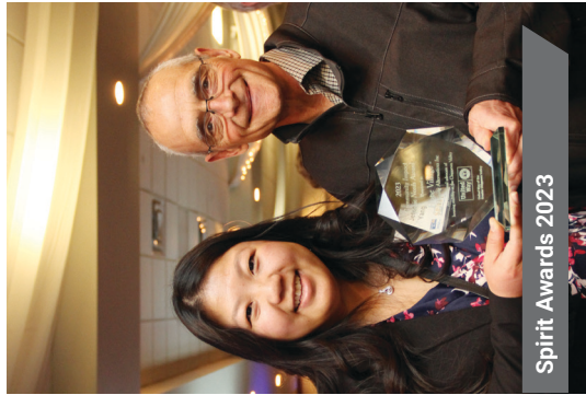
Spirit Awards 2023