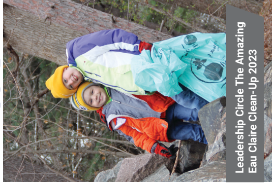
Leadership Circle The Amazing Eau Claire Clean-Up 2023