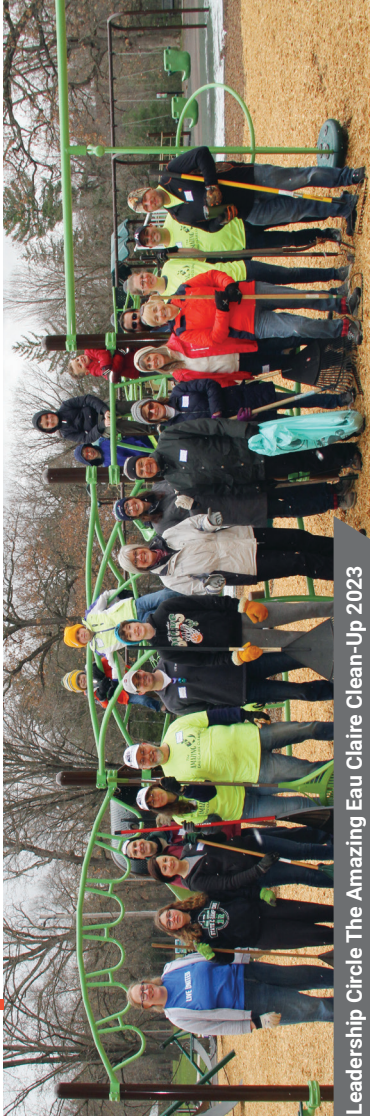
Leadership Circle The Amazing Eau Claire Clean-Up 2023

United Way of the Greater Chippewa Valley