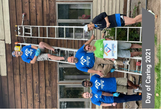
Day of Caring 2021