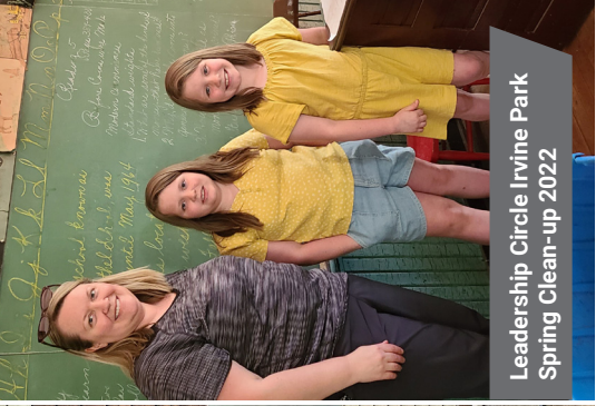
Leadership Circle Irvine Park Spring Clean-up 2022