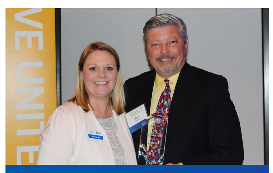
SPIRIT OF THE CHIPPEWA VALLEY AWARD: WIPFLI LLP